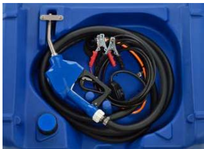
210 L with CENTRI SP30