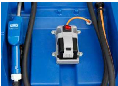
125 L with CENTRI SP30 and LiFePO 4 battery (characteristics see page 103)