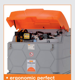
All equipment is positioned so that it is easy to see and access at an optimum level over the bund.