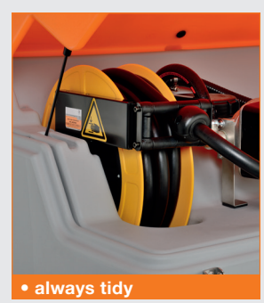
The automatic hose reel helps you to keep 8 m of hose in order.

Integral forklift runners assist with loading and installation. Moulded hexagonal matrix for integral polymer strength, supported by twin steel bands.