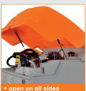
• robust, lockable lid

An open lid gives you unimpeded access to all components from three sides. Opens upwards on supporting gas struts to allow access from three sides.