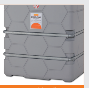
transport friendlydesigned-in stability

Integral forklift runners assist with loading and installation. Moulded hexagonal matrix for integral polymer strength, supported by twin steel bands.