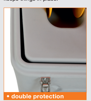
Integrated bund gives added environmental protection.