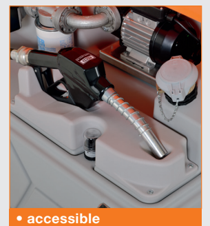
Integrated nozzle holder keeps things in place.

An open lid gives you unimpeded access to all components from three sides. Opens upwards on supporting gas struts to allow access from three sides.