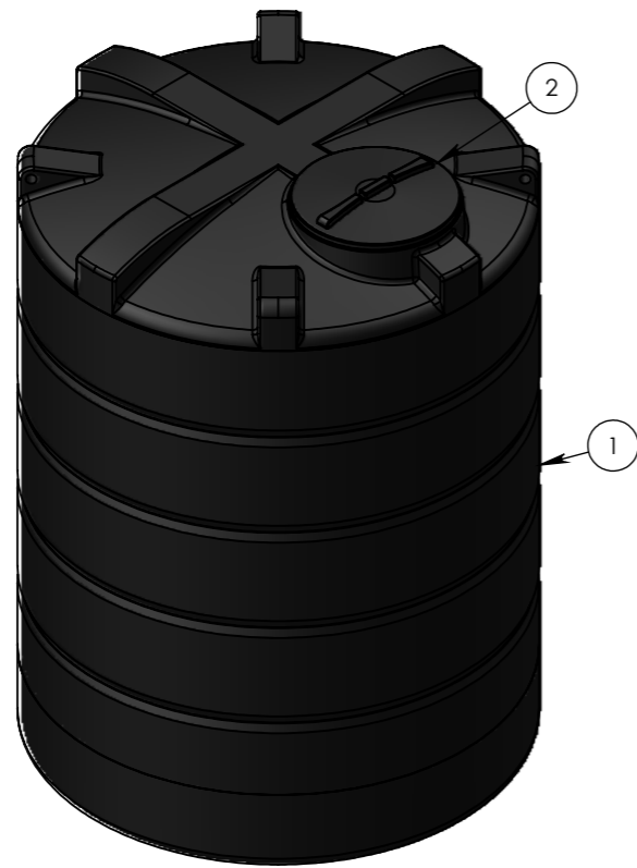
LEFT ISO VIEW